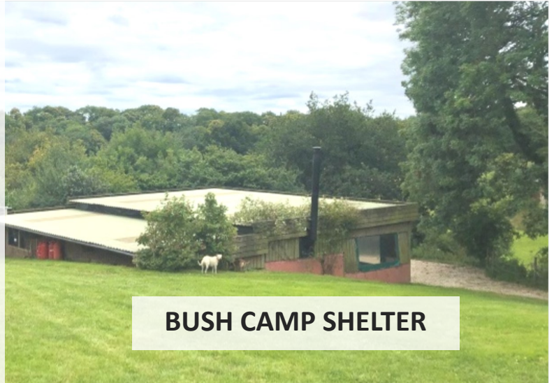
BUSH CAMP SHELTER

If you're not sitting outside admiring the view, taking in the peace and quiet or enjoying the last rays of sun, you can relax in the Bush Camp. The facilities are rustic and basic but provide essential home comforts. You will have use of the Bush Camp Kitchen in the main shelter for preparing food and eating meals and outside for alfresco dining.