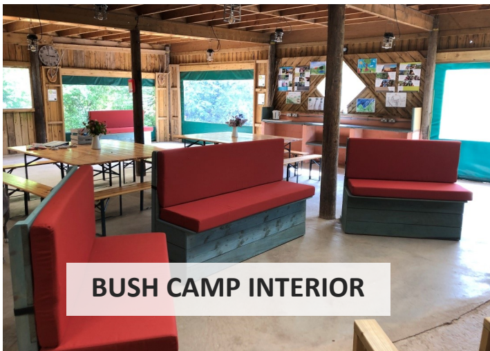
BUSH CAMP INTERIOR