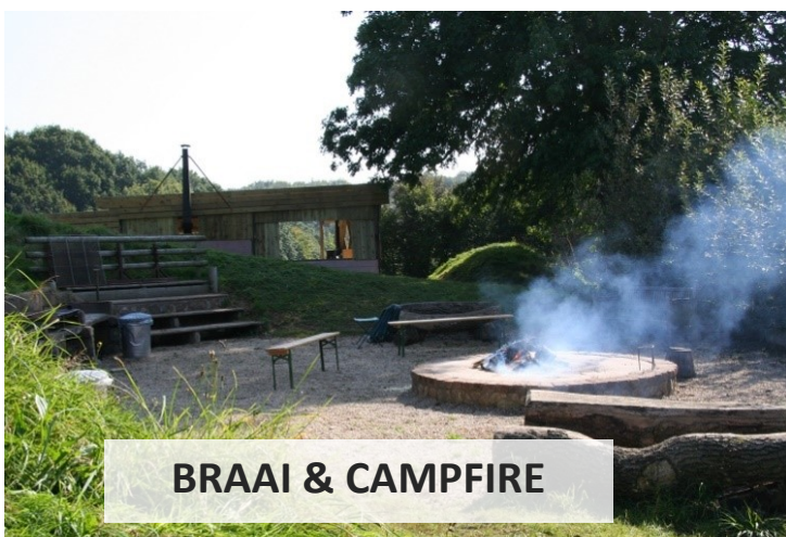
BRAAI & CAMPFIRE