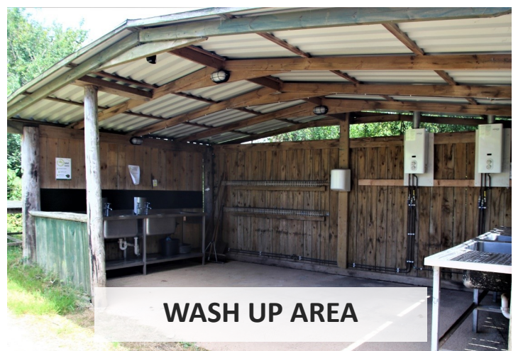
WASH UP AREA