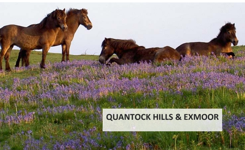
QUANTOCK HILLS & EXMOOR