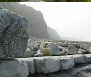
FOSSIL HUNTING AT KILVE BEACH