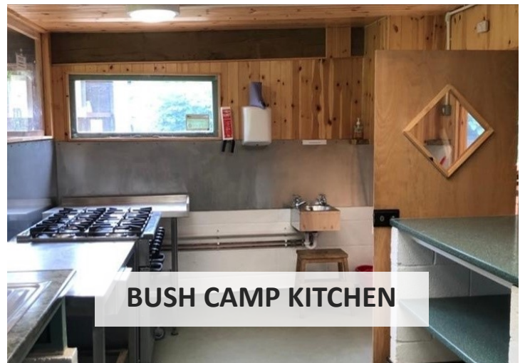
BUSH CAMP KITCHEN